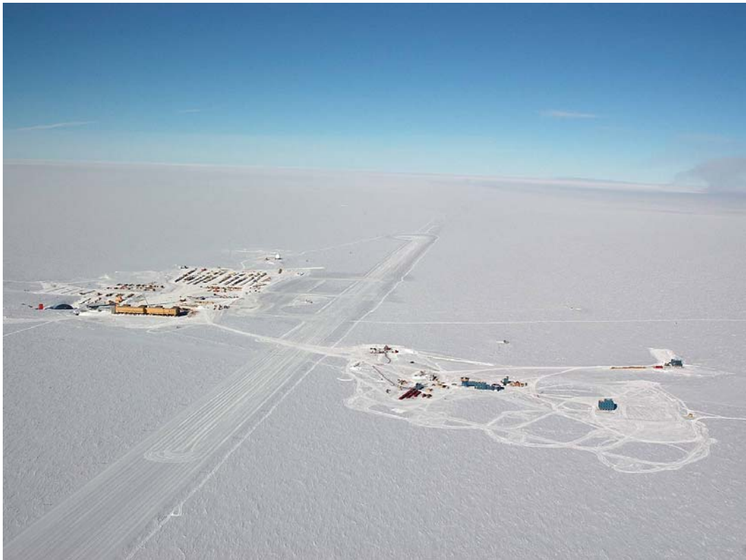
Areal view of the Amundsen Scott South Pole station. On the left of the skiway one sees the station (long building) with accomodation, cafetaria etc. On the right of the skiway the IceCube construction site is visible. The distance between the station and the nearest IceCube strings is about 1km